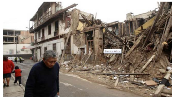
Figure 2- Collapsing buildings of Cultural value in Barrios Altos

The Municipality of Lima has created a special body, PROLIMA, which is in charge of the strategic vision for the renovation of the Historic Centre and its masterplan for 2025. Many of the maps brought together to justify this masterplan are produced by various governmental agencies, and include risk maps, socio-vulnerability maps, crime maps ect. In essence, these justify the renovation of the centre by depicting it as poor, crime ridden, and with high physical risk. Moreover, the renovation is promoted through private investment which would lead to gentrification and the expulsion of the inhabitants. Here, the research seeks to fundamentally challenge what is to be considered cultural heritage, moving beyond the attention solely on the architecturally valuable buildings, to also include the people that have been living there for generations.