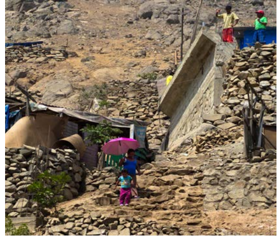
Figure 4-Exposure to high levels of physical risk

This paper will explain the process of mapping, the technology adopted (including drones, 3D printing, augmented reality and visualization), the spatial analysis undertaken together with local communities, and the learning acquired throughout this process. Two simultaneous modes of mapping were used: from the sky and from the ground. These were conceived with the purpose of articulating grounded applications and cutting edge technologies for community-led mapping and visualization and to explore the political agency and capacity of mapping to reframe the understanding of, and action upon, these highly contested territories.