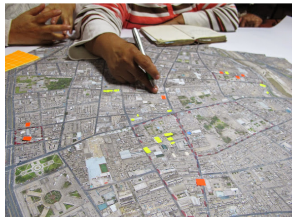
Figure 10- Identification of illegal storage and evictions in Barrios Altos

In a subsequent phase, DPU and CASA are further developing a mapping methodology tailored to the unique contexts of Jose Carlos Mariátegui and Barrios Altos. This phase focuses on data collection as well as explore planning scenarios based on the printed 3D models captured by the drones. The process activated by 'Mapping beyond the Palimpsest' is also feeding into the other processes such as the practice module of the DPU MSc Environment and Sustainable Development, to deepen and consolidate this spatial mode of enquiry and action planning.