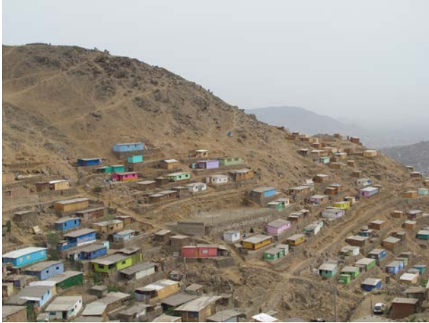
Figure 3-The occupation of the slopes in Jose Carlos Mariategui