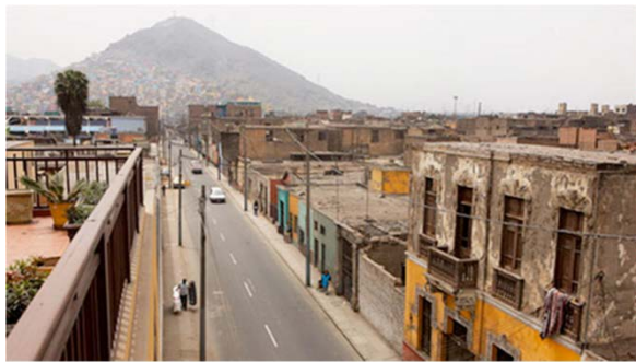
Figure 1- Barrios Altos- The Historic centre

Barrios Altos (BA) is located in the historic centre of Lima in an area declared UNESCO World Heritage Site (Figure 1). It is characterised by overcrowded conditions and lack of basic services. Due to its strategic location, it has high land values, however its buildings are left to deteriorate (Figure 2). The lack of public investment for its rehabilitation, together with the illegal change of use into storage, which is occurring at a fast pace, can be understood as a means to evict many of vulnerable inhabitants living on high value land. The process that converts many of the buildings into storage occurs through the retention of facades while gutting the interiors, in order to store containers with merchandise originating mainly from China.