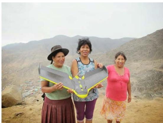
Figure 5- Drone flying in Jose Carlos Mariategui

Mapping from the sky used drones to capture 2D and 3D outputs (Figure 5 and 6). Moving beyond militaristic and surveillance applications, their value for planning was explored in the case studies undergoing otherwise 'invisible' change. In Barrios Altos, the bird's eye view captured through the use of drones made visible the otherwise 'unseen' processes of slow eviction and land use change occurring behind both conserved and deteriorating facades. In Jose Carlos Mariategui, the maps produced enable a detailed understanding of the difficult terrain that has to be negotiated by the inhabitants and the practices that make the slopes habitable. It also captured the shifting borders, the increased risk and the threatened ecological infrastructure, as well as the apprehension of the ravine as a system of interconnected settlements. Here the mapping is a means to open up dialogue between the inhabitants and the institutions which have various uncoordinated programs and projects in this area. It also seeks to enable the integrated planning of such areas and also support the preservation and management of the 'protected' ecological infrastructure for the functioning of the city.