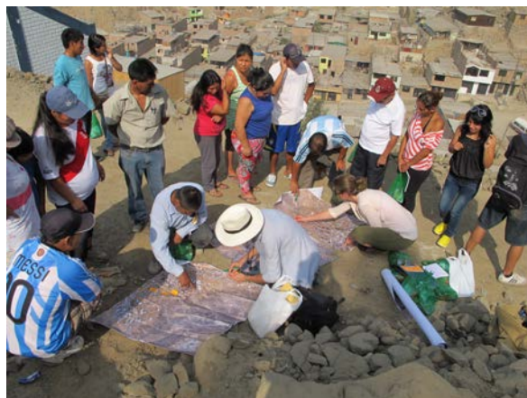
Figure 9- Preparing for a transect walk

Mapping from the ground brought together men and women from each of the two settlements, to discuss and decide what to map, why and how. Mapping was discussed by the residents as a way to apprehend their territory and a means to document and denounce otherwise invisible processes of unwanted change in their neighbourhoods. It was also seen as a strategic activity to foster dialogue between stakeholders and to expand the room for manoeuvre to promote strategic interventions. Once decisions were made about what was important to map, pilot transects were traced to collect the required information. The fieldwork tested various crowd sourcing applications using mobile phones to collect data. Moreover, the pilot walks served to reflect upon and refine the mapping focus, the selected variables and methods for further mapping (Figure 9 and 10).