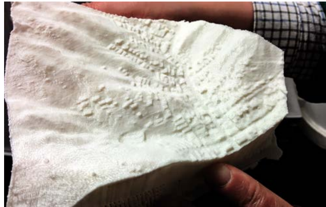
Figure 8- 3D model of Jose Carlos Mariategui

Mapping from the ground brought together men and women from each of the two settlements, to discuss and decide what to map, why and how. Mapping was discussed by the residents as a way to apprehend their territory and a means to document and denounce otherwise invisible processes of unwanted change in their neighbourhoods. It was also seen as a strategic activity to foster dialogue between stakeholders and to expand the room for manoeuvre to promote strategic interventions. Once decisions were made about what was important to map, pilot transects were traced to collect the required information. The fieldwork tested various crowd sourcing applications using mobile phones to collect data. Moreover, the pilot walks served to reflect upon and refine the mapping focus, the selected variables and methods for further mapping (Figure 9 and 10).