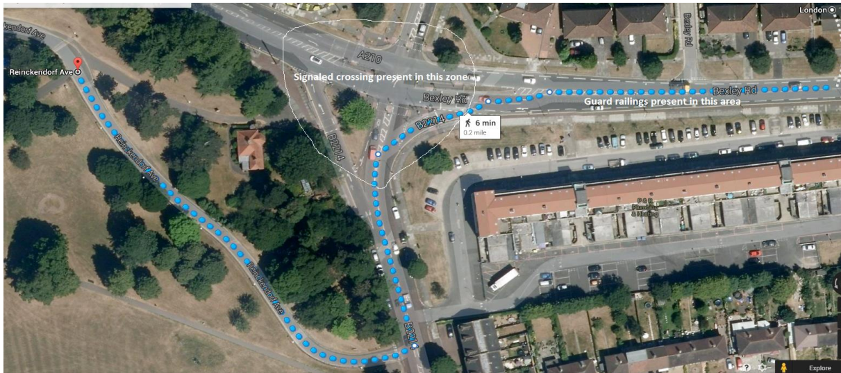
Figure 1 Google Maps image of pedestrian route navigation in Greenwich, London